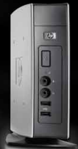
HP Compaq t5145 Thin Client*

All the hardware you need for seamless operation. There's only one place you need to look.