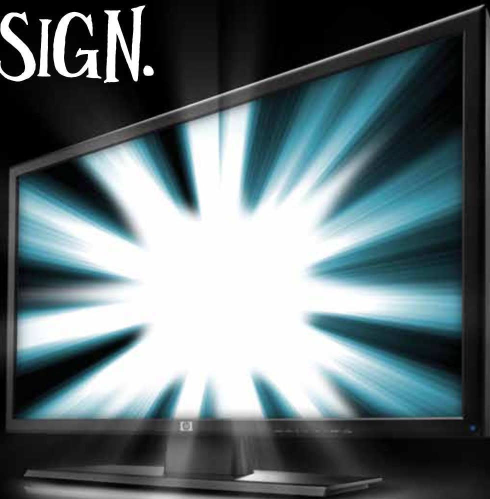
HP LD4200tm 42-inch diagonal Widescreen LCD Interactive Digital Signage Display